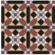
Minton Floor tiles